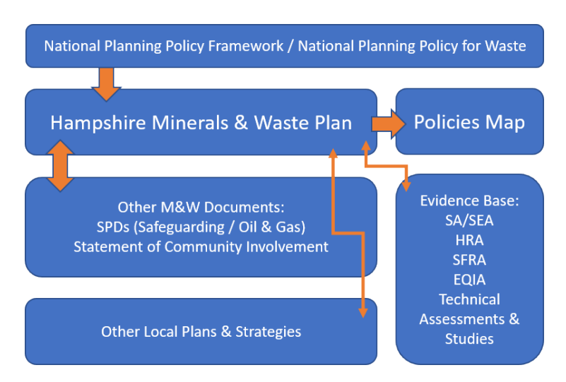
Figure 2: The Plan Linkages to other Strategies